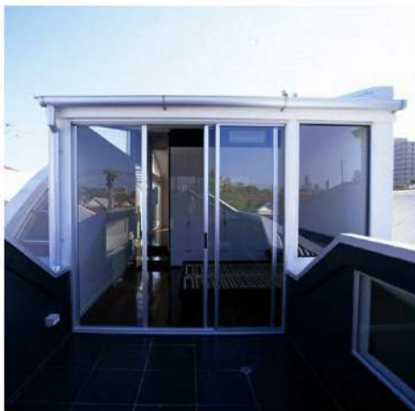
ALBERT PARK RESIDENCE