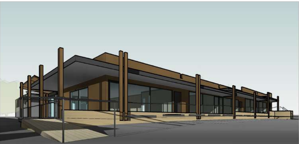
RETAIL DEVELOPMENT RIDDELLS CREEK