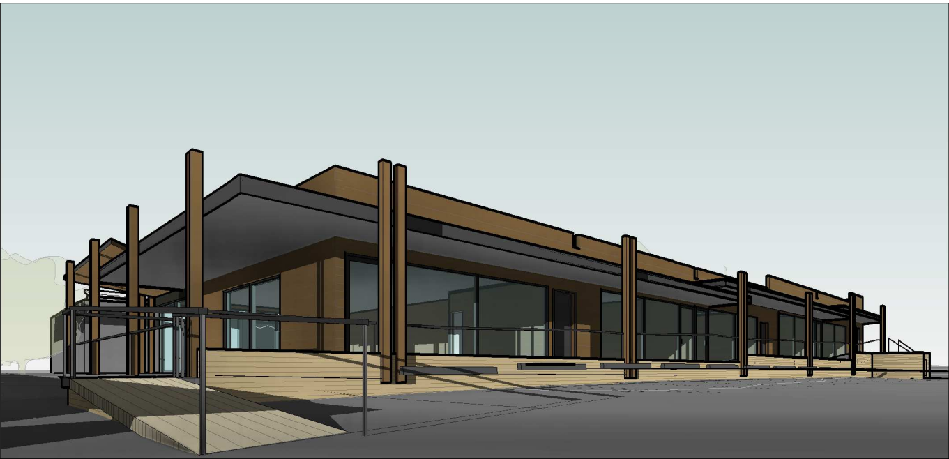
11 STATION ST RIDDELLS CREEK