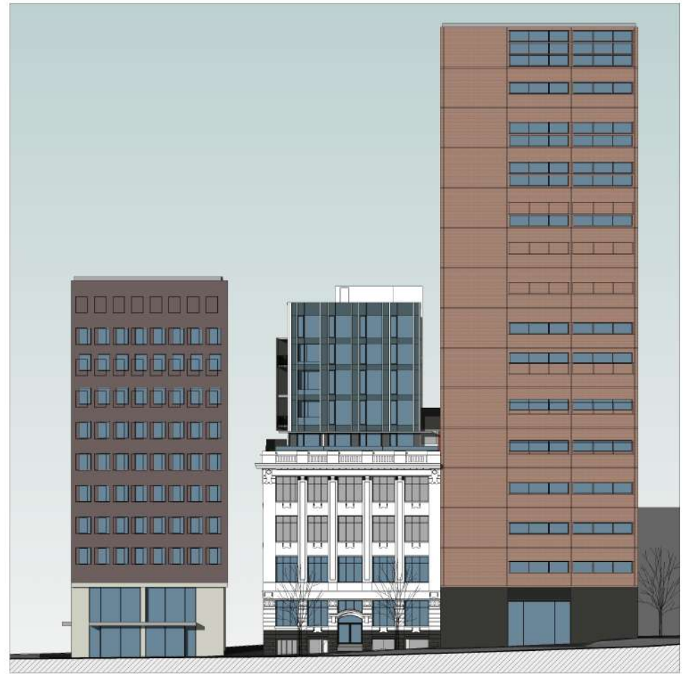
APARTMENTS LONSDALE ST MELBOURNE