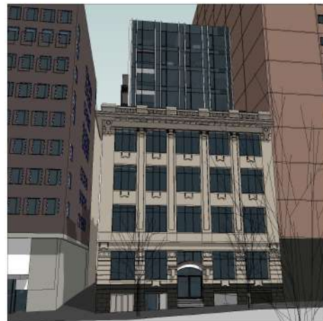
APARTMENTS LONSDALE ST MELBOURNE