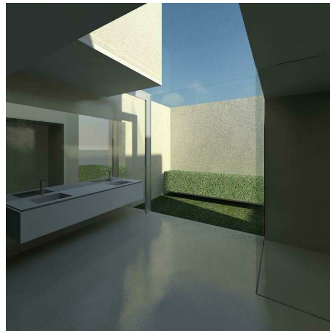
32 KENT GROVE CAULFIELD NTH