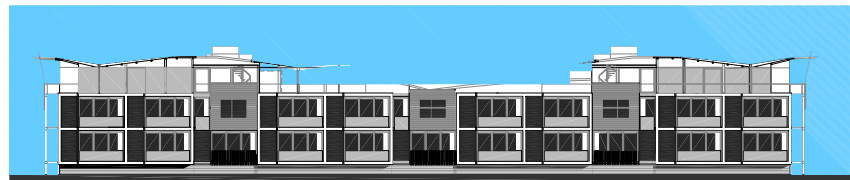
Elevation Building F