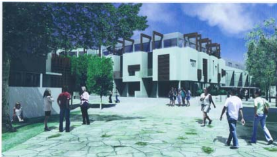
View from southwest

The former Rippleside shipyards in North Geelong is to be developed into a waterfront village comprising twelve medium and high density residential buildings, incorporating traditional townhouse and apartment housing models, and hybrid forms of each. The topography, shape and context of the site provided unique opportunities for an innovative design solution to each building. Several distinct precincts are proposed, each centred around common landscaped gardens and squares, or along the water's edge. The above characteristics of the site and brief, together with the three different approaches by separate architectural firms working collaboratively, will result in a series of diverse buildings, each with their own identity, yet linked together in a coherent urban landscape.